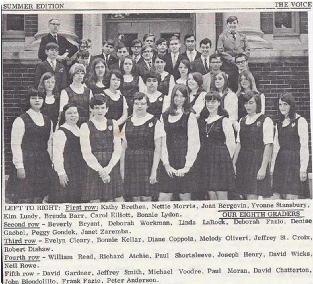
8th grade Sacred Heart, Watertown, NY